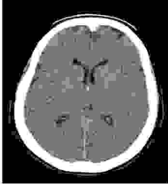
Fig 1: CT Brain Plain Showing Brain Edema

whole right half of the body as compared to left side. Her abdominal, cardiovascular & respiratory systems examination was normal.