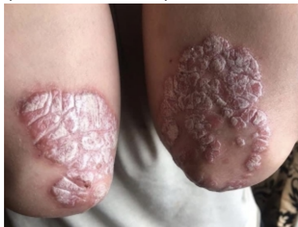
Fig.2: Plaque Psoriasis: silvery-white scales and erythematous plaques on the dorsum aspect of elbows.

Psoriatic erythroderma: It's generalized erythema of the skin. It could be due to plaque psoriasis, or it can be a separate entity. Scales may be variable depending on the rapidity of onset. It's a life-threatening disease due to the risk of dehydration, loss of albumin, hypothermia, and superadded infection. D/D includes drug-induced erythroderma autoimmune erythroderma.