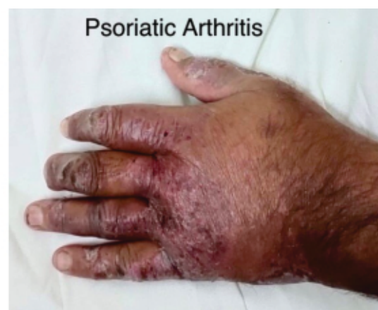
Fig. 6: Psoriatic Arthritis. Deformities of the Finger Joints at Proximal & distal Interphalangeal Joints with sparing of the MCP joints are obvious. The psoriatic skin rash is Present

Enthesitis & Psoriasis: plantar fasciitis, Achilles tendon, patellar tendon, iliac crest, epicondyles, and supraspinatus tendon are common sites for enthesitis. Tenosynovitis is also common. It can also be in Ankylosing Spondylitis (AS). Inflammatory clues on MRI include increased vascularity of the normally avascular tendon area. Other clues are soft-tissue oedema & bone marrow oedema of the adjacent bone. Doppler can also detect some of these changes. 16