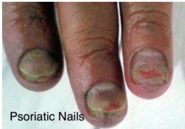
Fig. 3: Psoriatic nails.