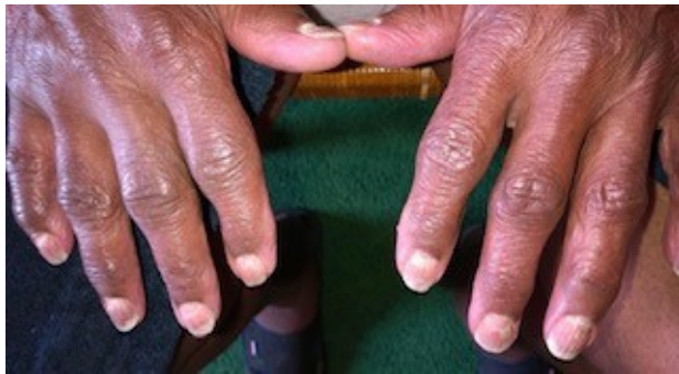
Fig. 4: Psoriatic arthritis & OA: Psoriatic nail changes are present too.