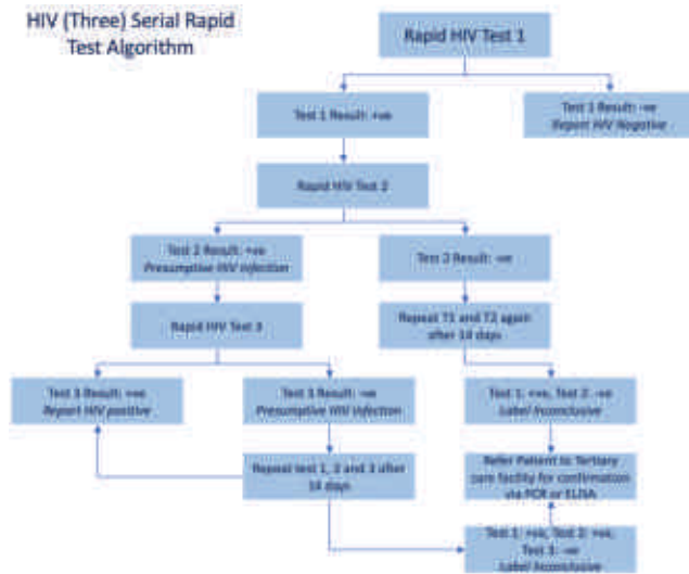
Figure 1: HIV (Three) Serial Rapid Test Algorithm 25

There are around 50 centers in public hospitals throughout the country where HIV diagnostic testing is done. Apart from that, there are community-based organizations in 8 cities that do community HIV testing: 5 for transgender communities, 4 for men who have sex with men and male sex workers, and 4 for female sex workers.