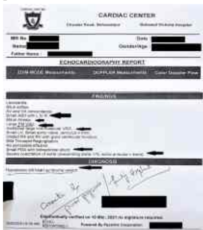
Figure 2 Echocardiography report revealing mitral atresia, ASD, VSD, coarctation of aorta and small

sized left ventricle confirming the diagnosis of HLHS